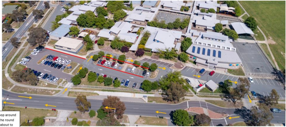
Loop around the round about to rejoin the line.